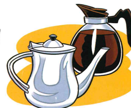
tea or coffee